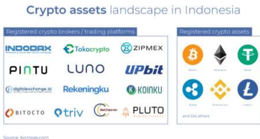
Figure 2. Crypto Exchange Landscape in Indonesia

Meanwhile, this is different from the situation in Indonesia. In Indonesia, government regulations and rules regarding Cryptocurrency have experienced a number of developments in recent years. The following is an overview of government regulations and rules regarding cryptocurrencies in Indonesia: Initially, cryptocurrencies such as Bitcoin were introduced in Indonesia without clear regulations. However, in 2017, Bank Indonesia, the country's central bank, issued a regulation prohibiting the use of cryptocurrencies as a means of payment. Bank Indonesia considers that the use of Cryptocurrency in transactions can endanger the stability of the country's financial system and has the potential to be used for money laundering and terrorism financing. As a result, the use of cryptocurrencies as a means of payment was immediately stopped. Even crypto assets that are quite popular have been widely accessed via various platforms, as in the following image: