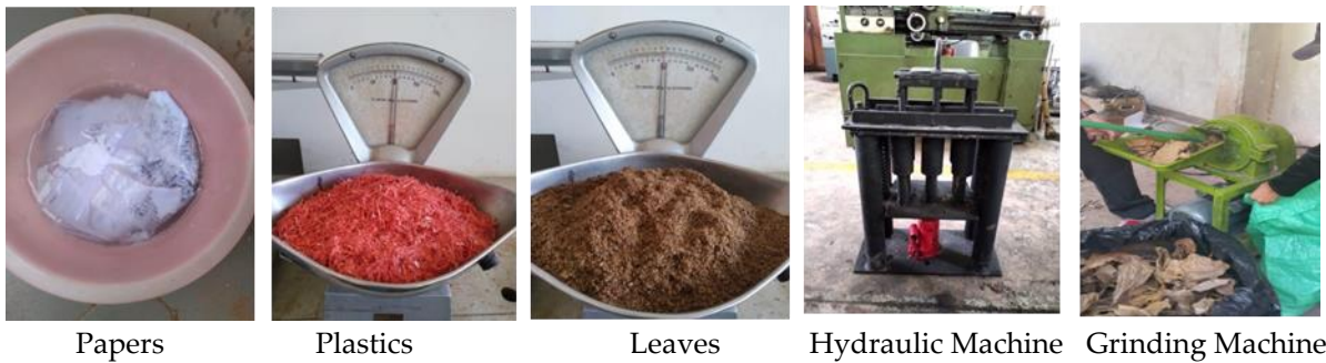
Figure 2. Material Components and Equipment