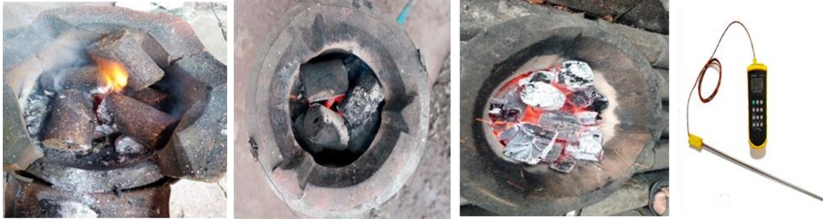
Figure 4. Temperature Experiment and Burning Time