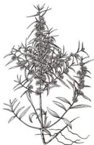
Figure 4. Kumarshyk plant