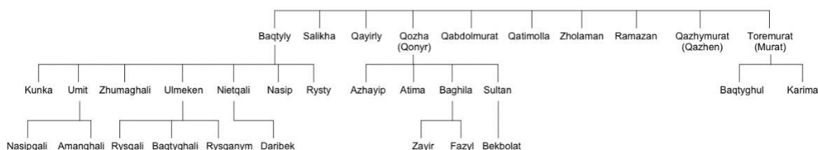
Figure 3. Dina’s descendants with Nuraly