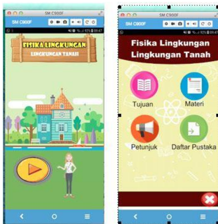
Figure 2. Display of teaching material applications via mobile

study materials is arranged in the form of teaching materials in the form of modules and power points that can be easily accessed by students. In addition to printed teaching materials, students are also given teaching materials in the form of applications that can be accessed through mobile phones. Application of environmental physics courses as shown in Figure 2 .