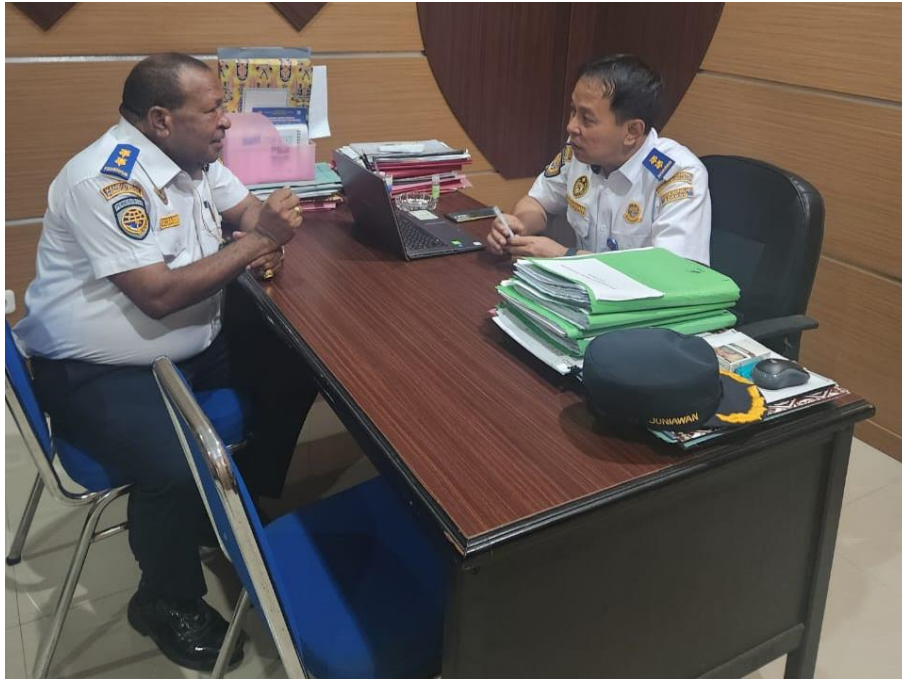
Figure 2. Interview with Source

Supervision and Enforcement of Rules: Although briefings before loading and unloading activities have been conducted to emphasize the importance of using PPE, supervision in the field still needs to be improved. Sanctions given to workers who do not comply with the rules on the use of PPE tend to be light, such as verbal warnings and temporary bans from activities in the loading and unloading area. This results in low worker compliance with the use of PPE in accordance with regulations.