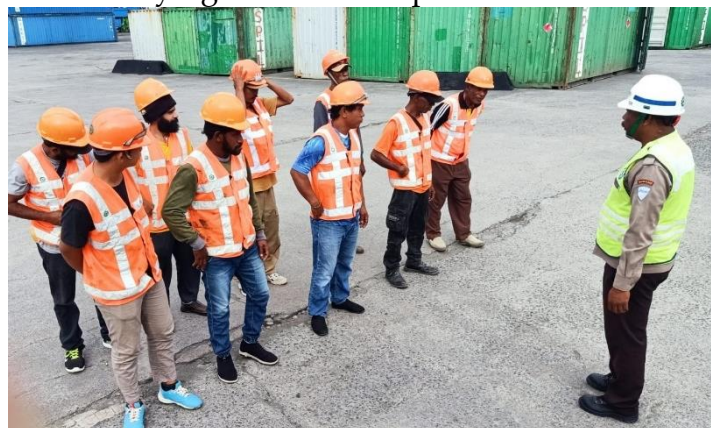
Figure 1. Briefing Before Starting Loading and Unloading Activities

This study aims to analyze how the implementation of the Regulation of the Minister of Manpower and Transmigration Number PER.08/MEN/VII/2010 concerning Personal Protective Equipment (PPE) is applied in the loading and unloading process at Sorong Port. Through interviews with various parties directly involved in loading and unloading activities, such as the Head of Traffic and Sea Transportation, Assistant Manager of Management Systems, HSSE and Customer Development, and stevedoring workers (TKBM), it was found that this regulation has been implemented with varying levels of compliance.